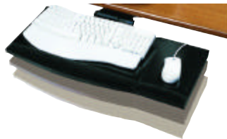
Height Adjusts 6"